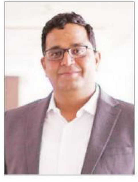
Vijay Shekhar Sharma, founder & CEO of Paytm

PRESS TRUST OF INDIA New Delhi, September 4