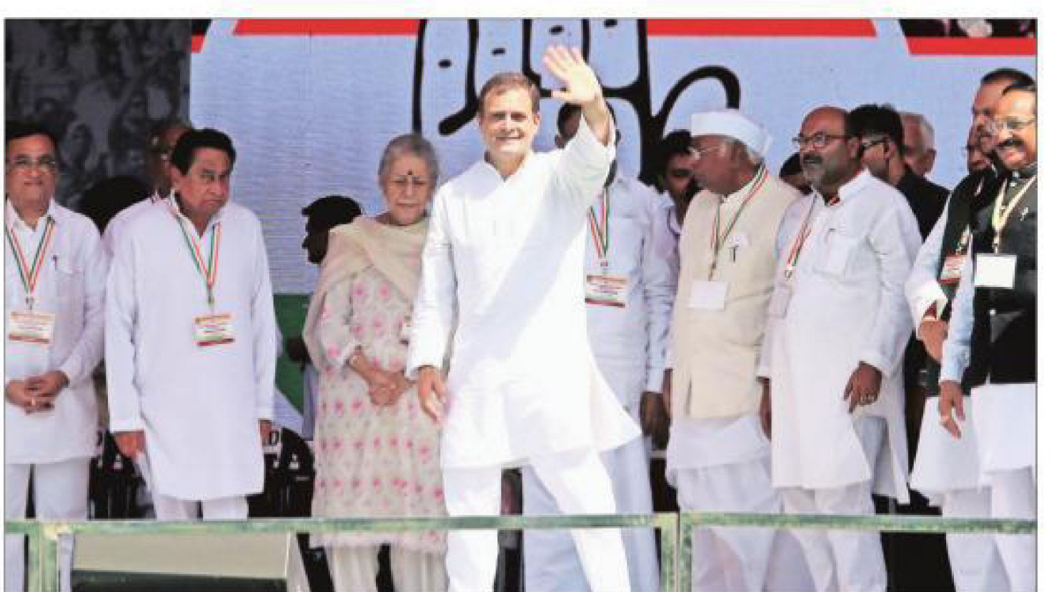
Rahul Gandhi and other Cong leaders at the rally in Ramlila Maidan in New Delhi on Sunday.

SET TO EMBARK on a nationwide yatra next week, senior Congress leader Rahul Gandhi Sunday said there is no option before the party but to go to the people directly as the government has stifled the voice of the Opposition in Parliament, controlled the media through two industrialists, and has attacked and put pressure on India's institutions, be it the judiciary or the Election Commission. Significantly, he also said the Congress and the Opposition "together... will defeat the ideology of the BJP and RSS." Addressing the Congress's Mehangai Par Halla Bol Rally at the Ramlila Maidan here, Rahul followed a familiar script. Mirroring his earlier speeches, he accused the Narendra Modi government of spreading "hatred, anger and fear", of benefiting industrialists, and using agencies like the CBI, Enforcement Directorate and Income Tax department to target those who speak against the Prime Minister. Rahul also framed the battle against the BJP as, again, a battle of ideologies. With one difference. In his concluding address at the Udaipur Chintan Shivir of the party as recently as May Rahul had said that the